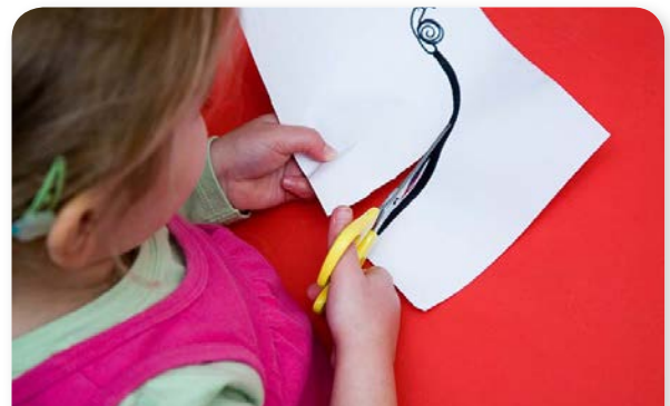
Next, try to cut paper