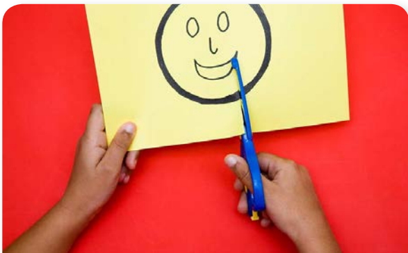
Keep thumbs on top (scissors and paper)