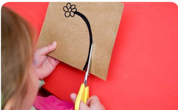
Try to cut thin card first