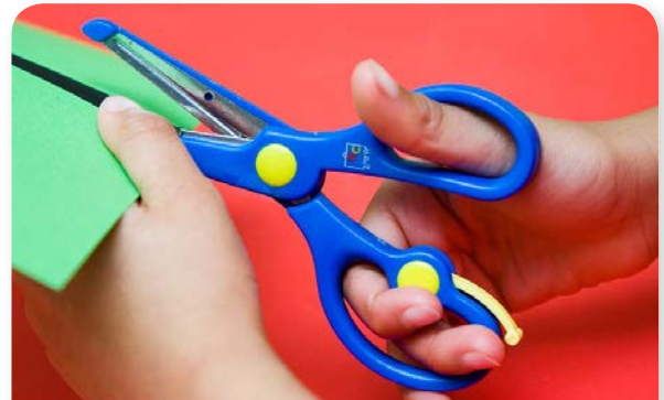
When able, cut without spring