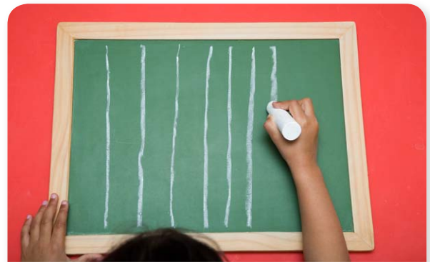
Draw top-to-bottom lines Say, "Down"