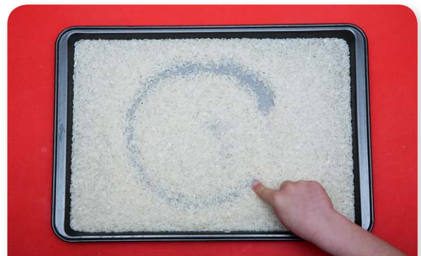
Draw anticlockwise circles Say, "Up and around"