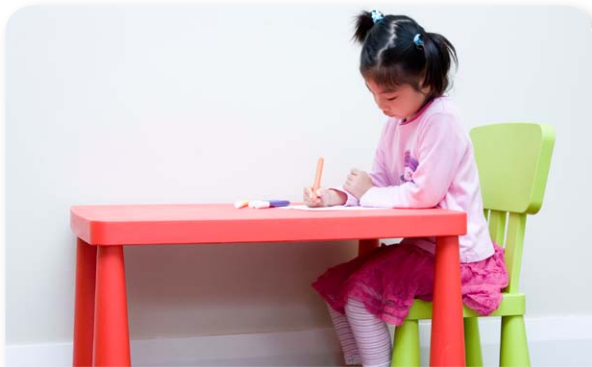
Try sitting at a table