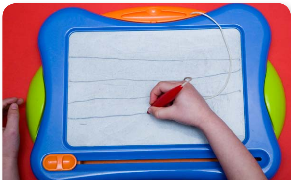
Draw left-to-right lines Say, "Sideways"