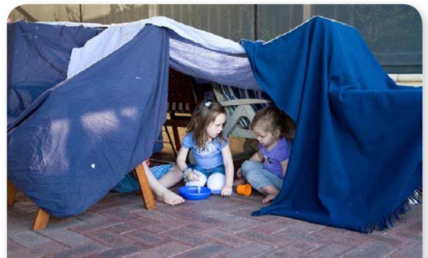
Build a cubby