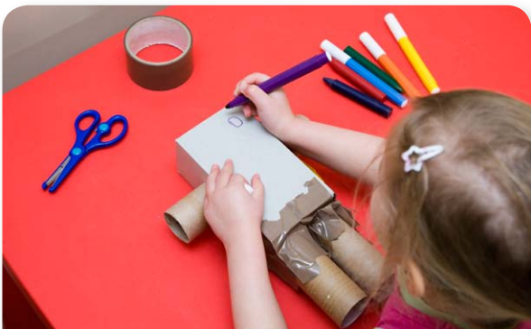
Make craft creations