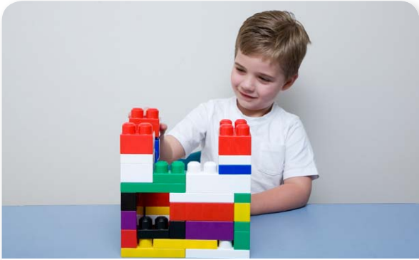
Build with blocks