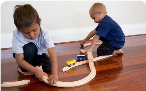
Build a train track