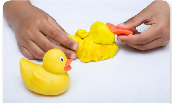
Make things with playdough